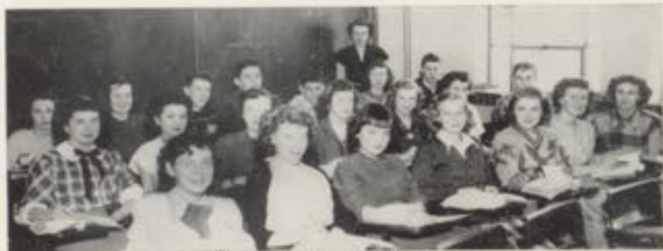
BIOLOGY—You Mean Bug-ology