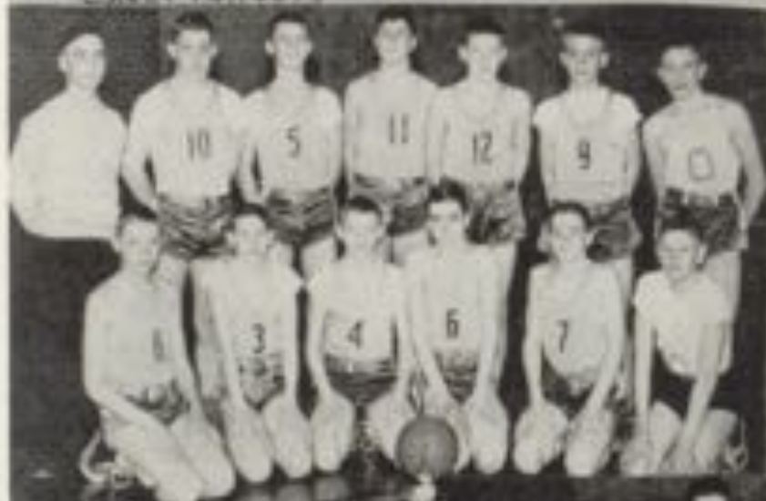
Junior High Team