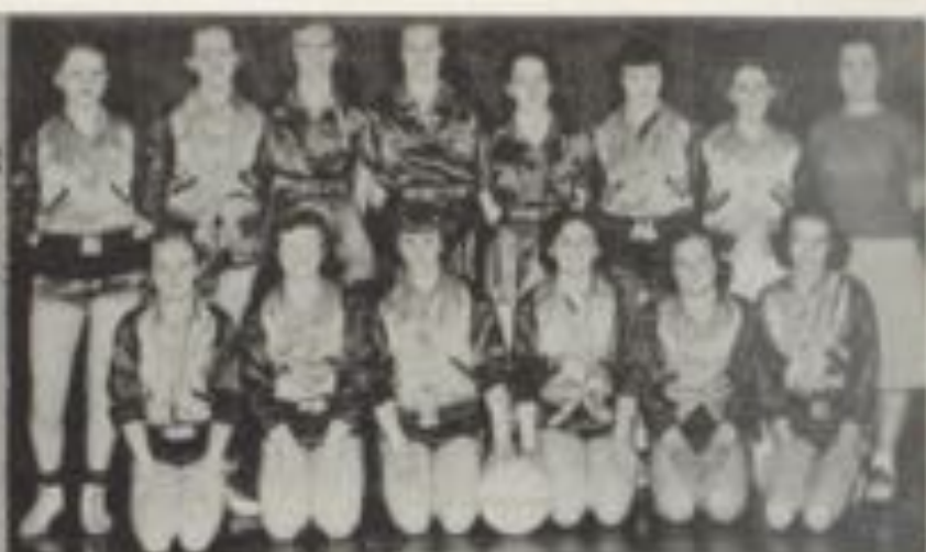
Girls B.B. Team