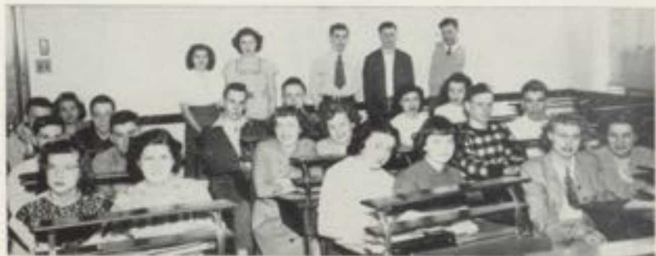
AMERICAN LITERATURE—We Even Have Angel Food Cake