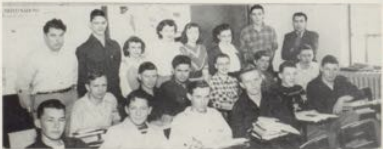
WORLD HISTORY—The Pictures "Prof." Draws Make it Interesting