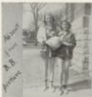
No. 1 A.B. Archery