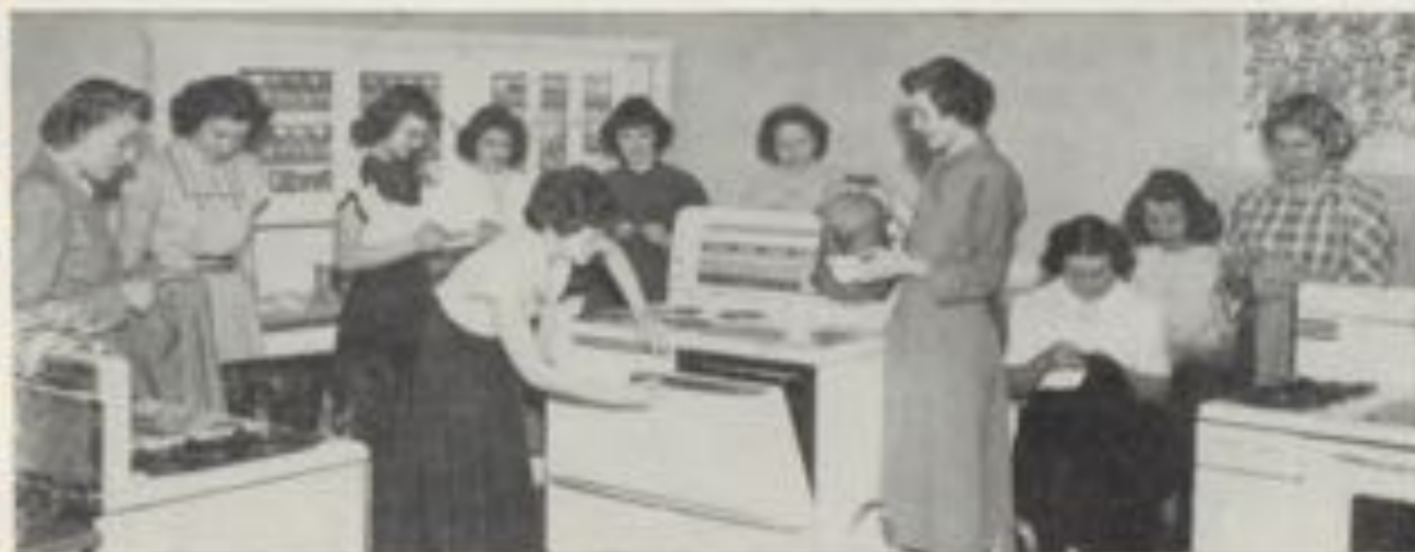
HOMEMAKING II—The Formality Of It All