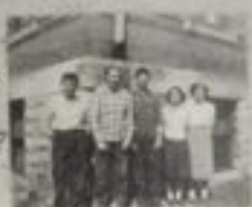
New Summers O.H.S.