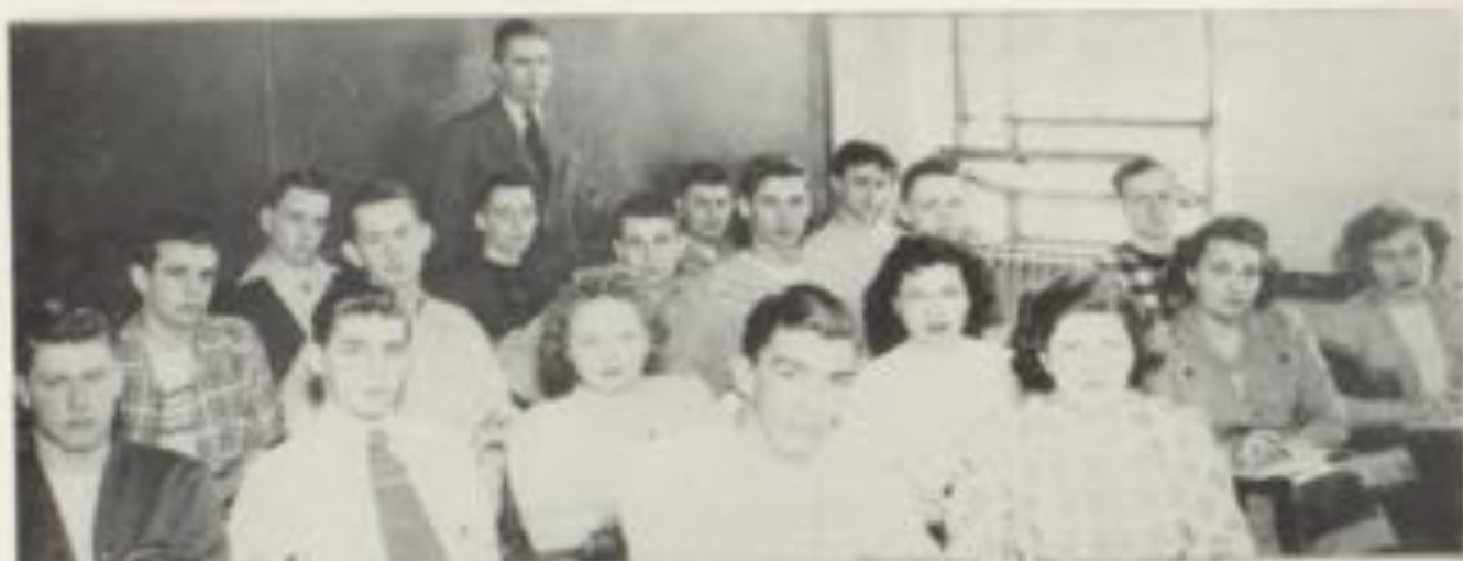
SENIOR GRAMMAR—Nouns, Verbs, and Then We Have Spelling