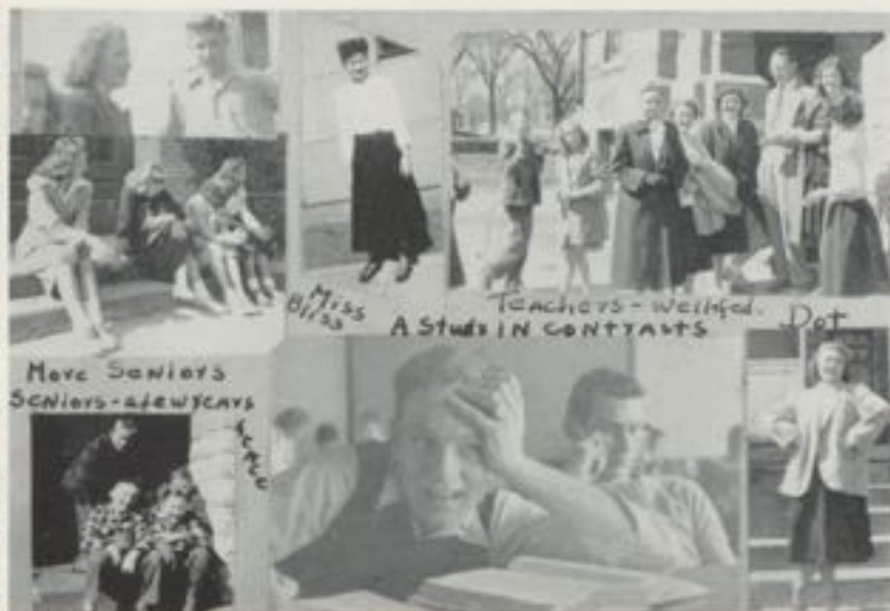
Miss Bliss Teachers - Weighed. A Study in Contrasts. Dot