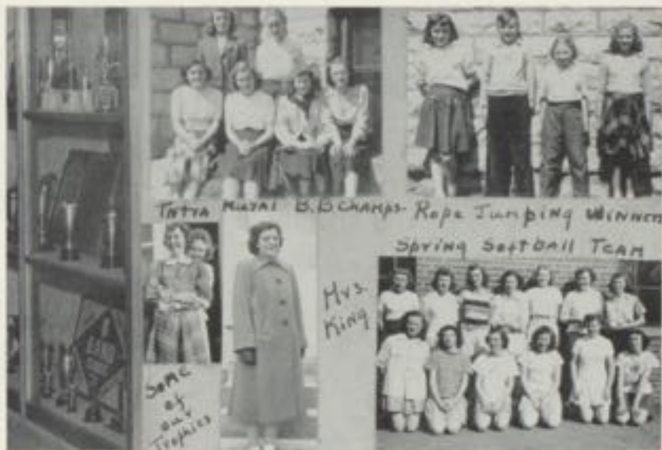
TATYA MIZAL B. O. CHAMPS- Rope Jumping WINNERS SPRING SOFTBALL TEAM