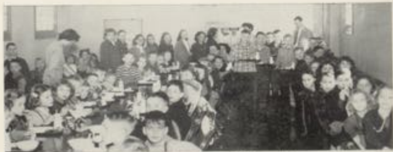
HOT LUNCH—The Customer Is Always Right