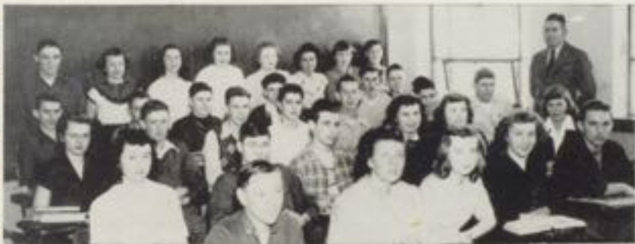
ENGLISH LITERATURE—From MacBeth to Reader's Digest