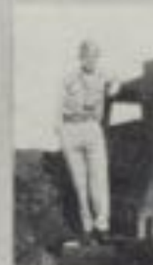
"GEM. BENG FORD"