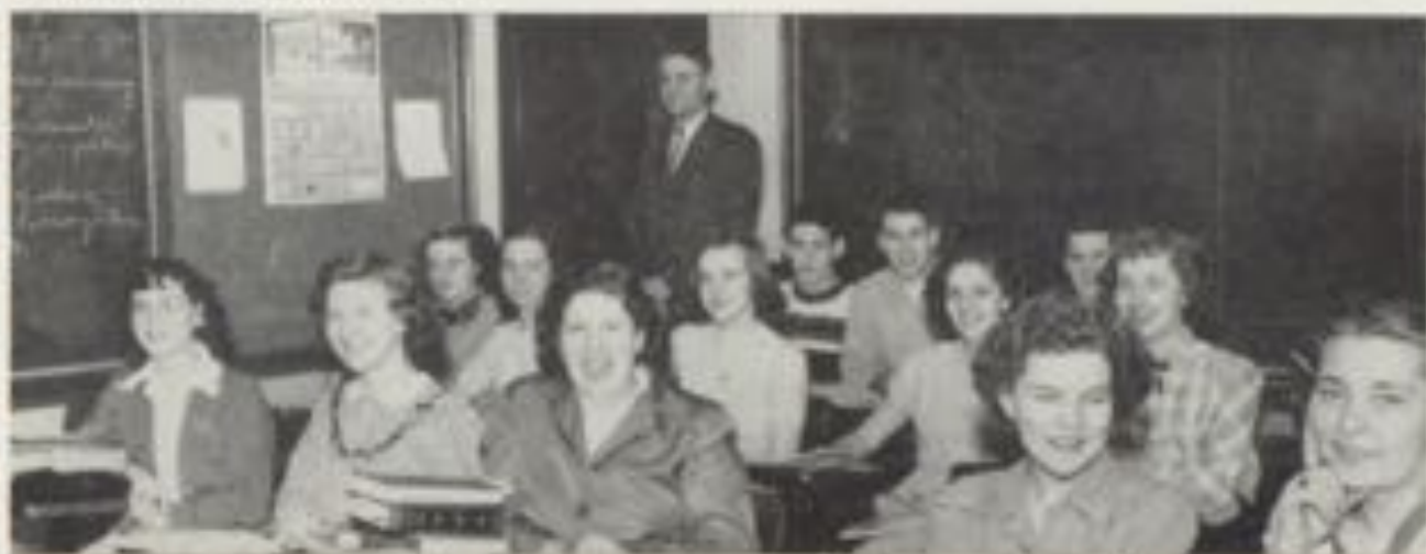
SOCIOLOGY—Those Extra Subjects That Drift in Break The Monotony