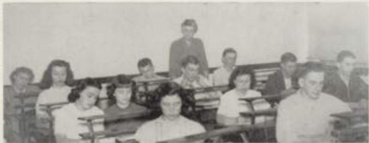
BOOKKEEPING—Often More Trial Than Balance