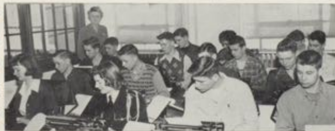
GENERAL TYPING—asdf ;lkj