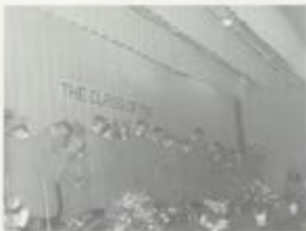
1967 Graduating Class