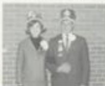
Our King and Queen