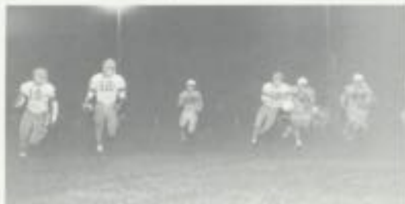
MOVE IT, SCOTT!