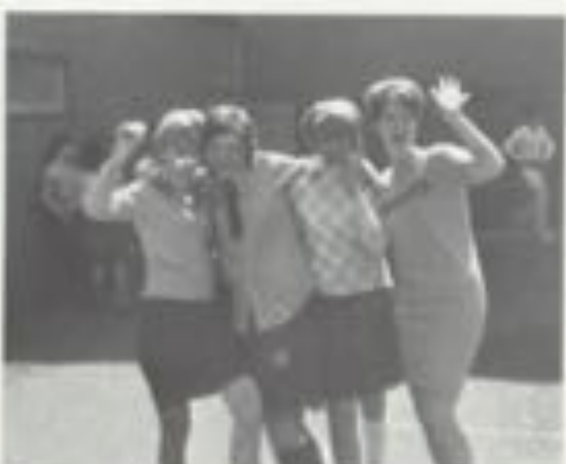
Sunday go-to-meeting' duds