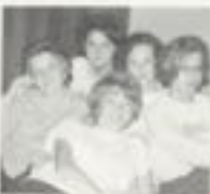
Great big Browale smiles