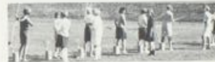
Robyn Hoodettes of '60