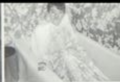
Lauree always was a little eccentric.