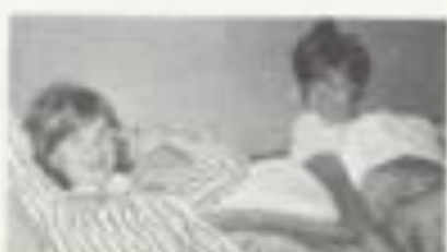
Watch the birds!