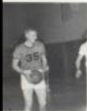
What are the rest of your measurements?