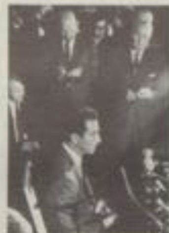
10. Hitless King Retires —Lalibander Sandy Kousser of the Los Angeles Dodgers announced on November 18th that he was retiring from baseball due to an arthritic elbow. Winner of the Cy Young Award three times, Kousser set an all-time record of 362 strikeouts during the 1960 season.