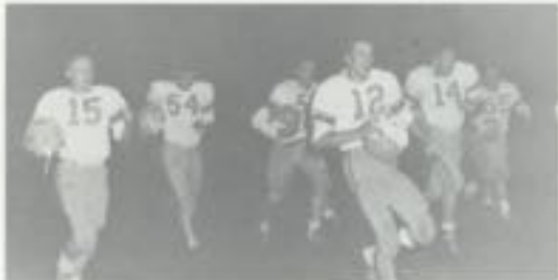
HATS OFF TO THE TROJANS!