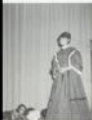
"Getting to know you"