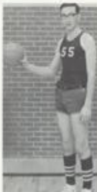
TOM HARGENS Senior Center