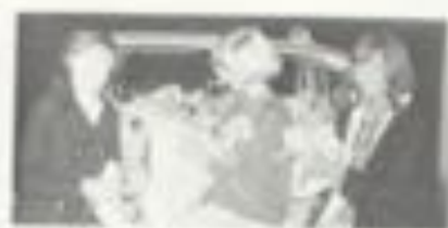
Wom-oo gets stuffed tonight?