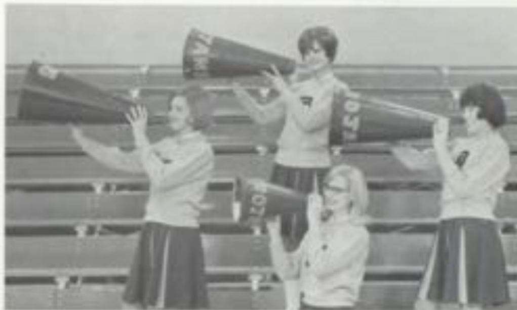
GIRLS FIRST TEAM