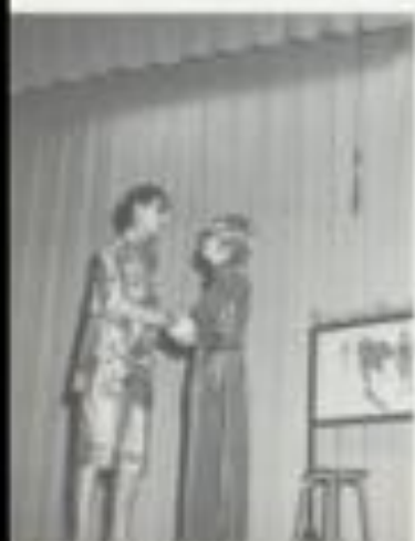
"We kiss in a shadow"