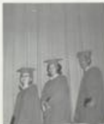
Three Graduating Seniors