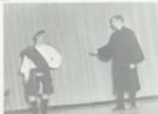
The Reverend presents an angry soldier to his "mother."