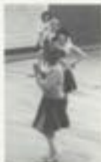
WE back out team!