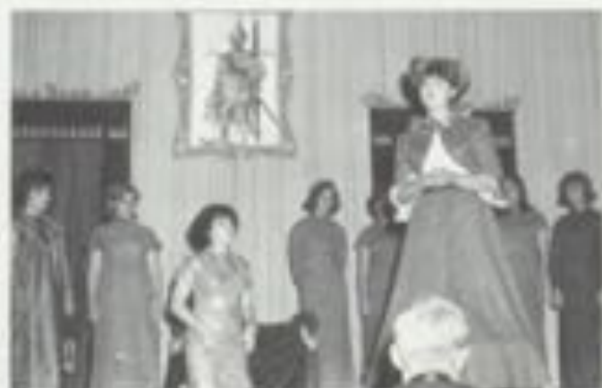
"Hello, young lovers"