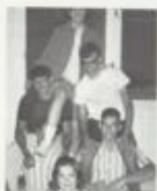
Heap big team-joke