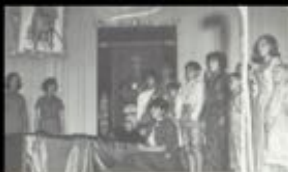
"This is a man who thinks with his heart."