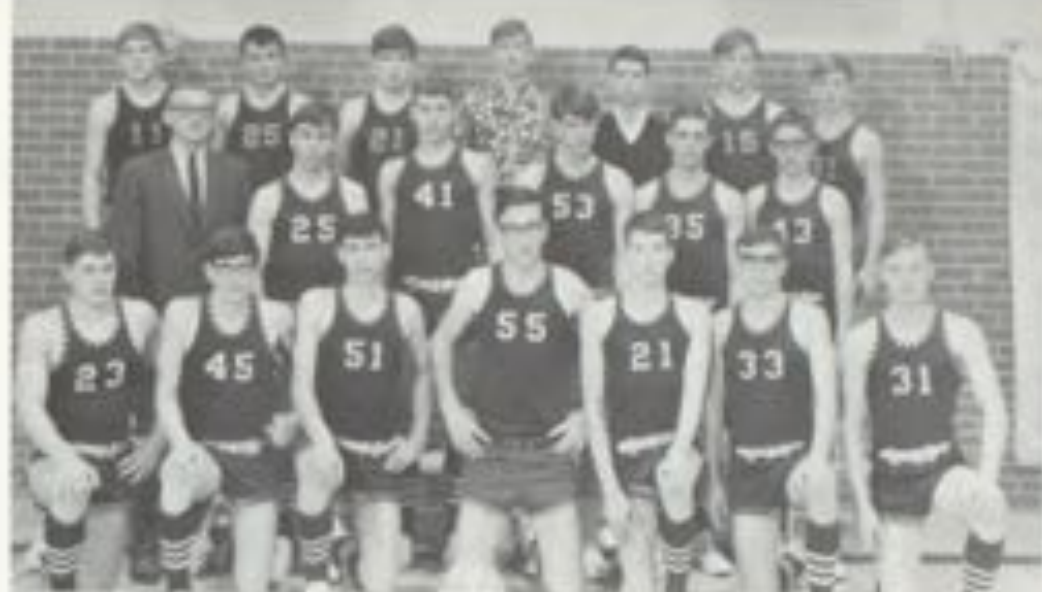
BOYS FIRST TEAM