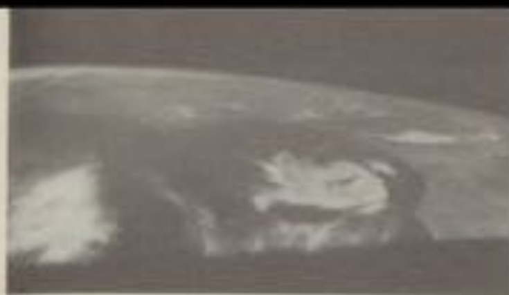
7. Photograph Shows New Heights —This photograph was taken from an altitude of 513 miles during the Gemini 10 space flight of astronauts John W. Young and Michael Collins in July of 1966. Gibraltar appears in the upper right.