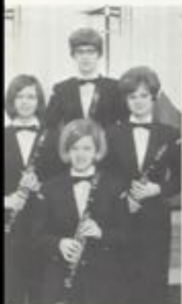
CLARINET QUARTET A