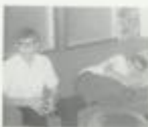
Wasn't they lovely... as Freshmen!