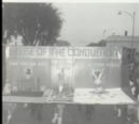
Winning Poster--Seventh Grade