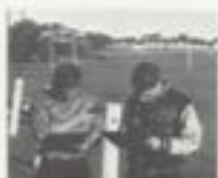
Track Meets can be Deadly.