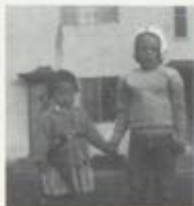
1968 Football CO-CAPTAIN And friend