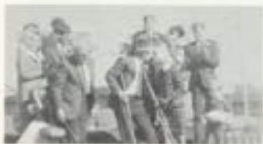
Best part of being King