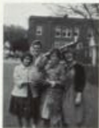
"In" crowd at Arthur