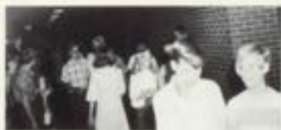
That stuffy feeling