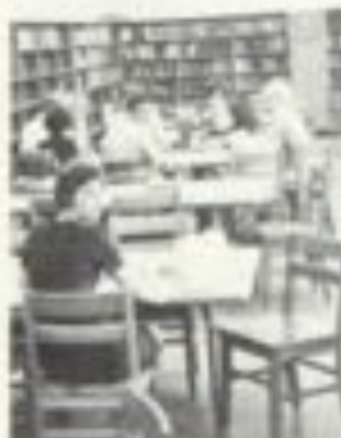
Whatta Matter, Fatty, won't nobody talk to ya?