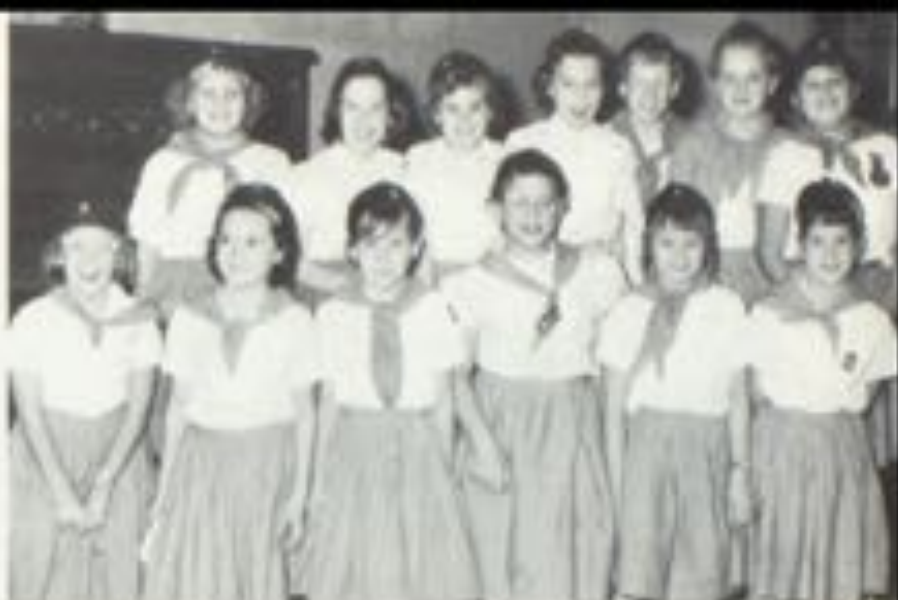
Great Big BROWNIE Smiles