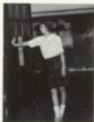
Work, work, work!