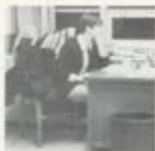
Life is a dream