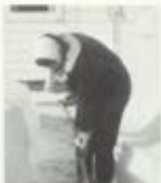
Who'd believe this with- out a picture?