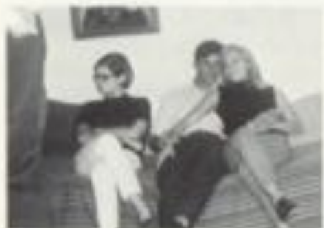
A woman scorned?