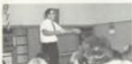
"Get into the mood of the song!"