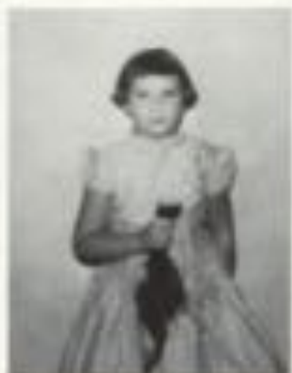
History repeats itself