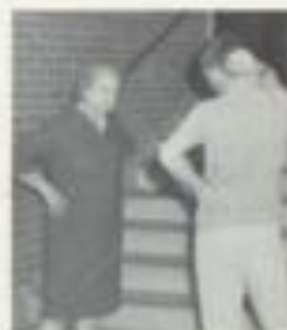
"But gee, Miss Berg!"