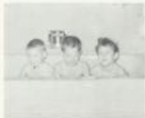
Hub-a-dub-dub Three Flyers in a tub