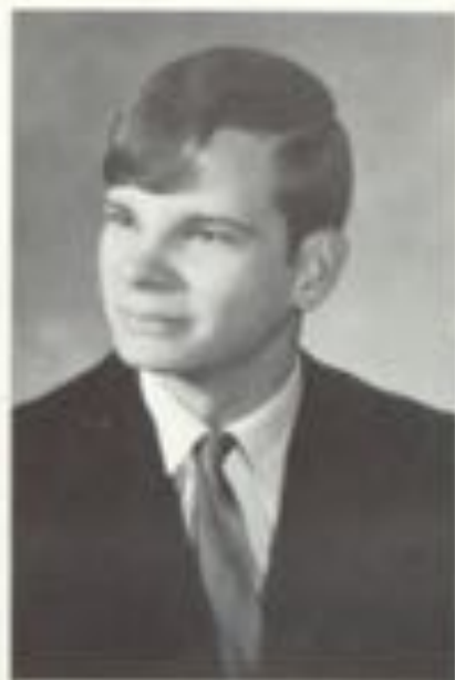
TOM SIMPSON "I hate being late, but it beats hurrying."