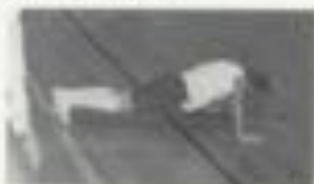
These P.E. classes get harder and HARDER