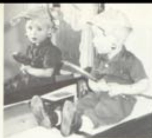
All dressed up--and no place to go