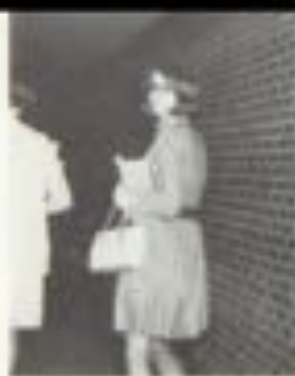
Is my dly showing?