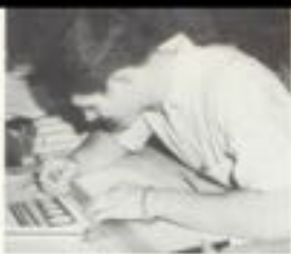
Pretty funny, huh Finner?