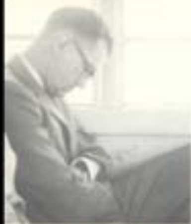
Rip Van Waterbury