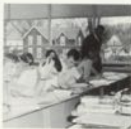
Class is serious business.