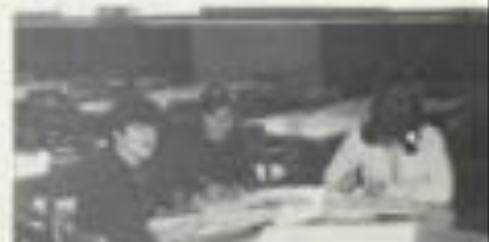
Serious (?) Seniors