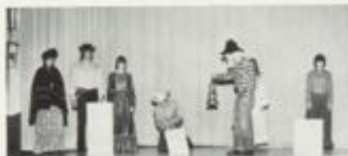
No Len, No More