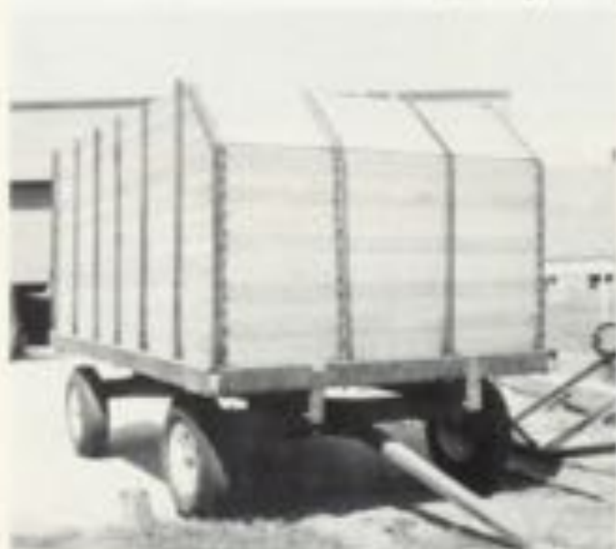
FFA Projects through the year 1971-72.