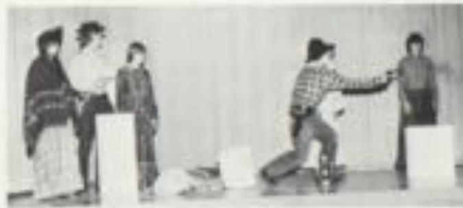
Deal and Draw