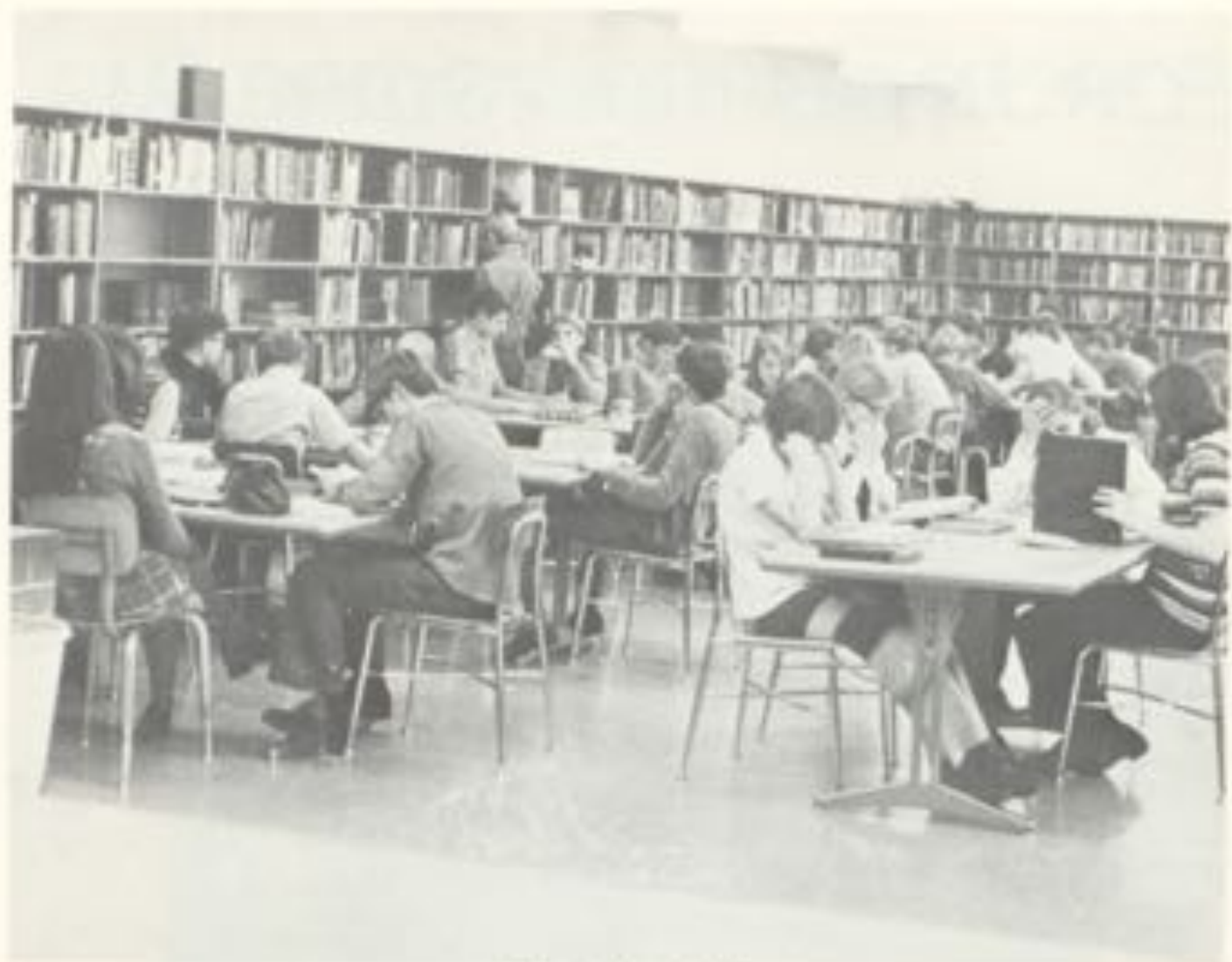
Another day of study hall.