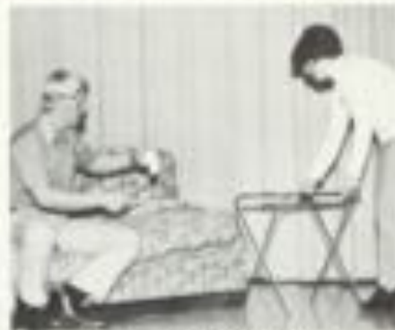
"I haven't finished yet."