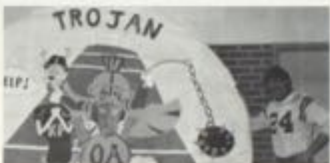
What are ya waitin' for?