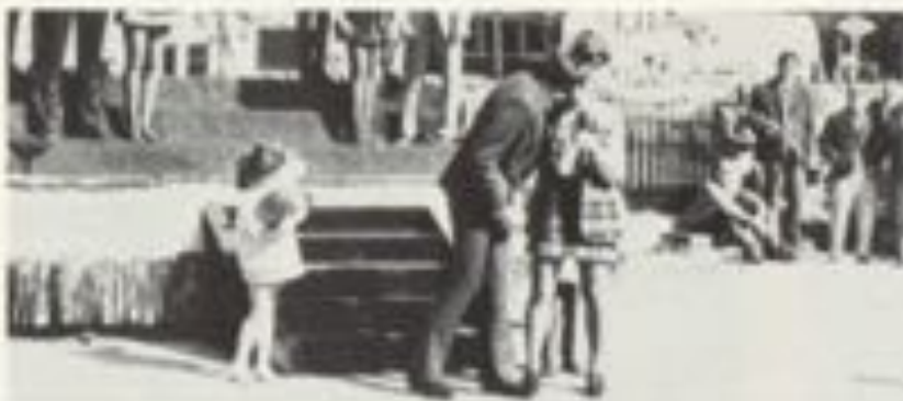
Third time's a charm!