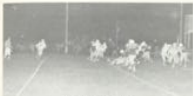
Don't drop it, guys!