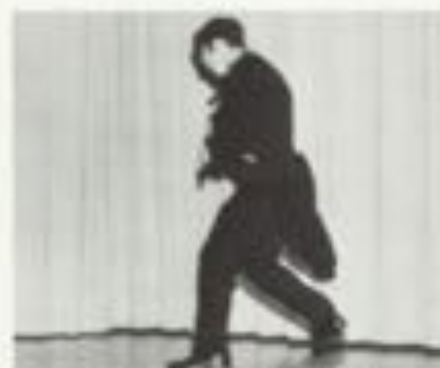
To the bar and girls!!!