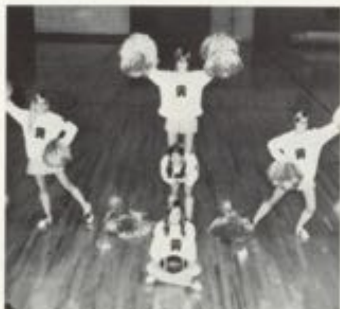
JUNIOR VARSITY FOOTBALL