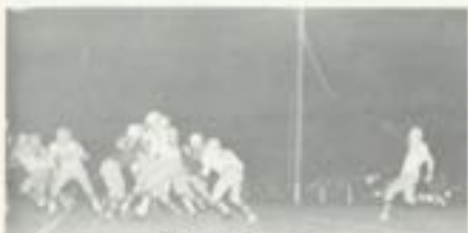
Good punt, Chuck.