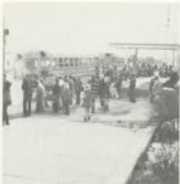
Going home again!