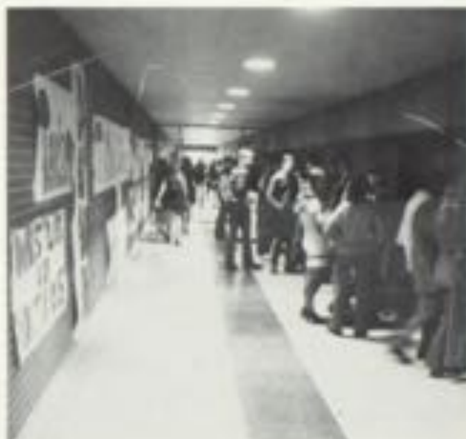
Students preparing for class at 8:20.