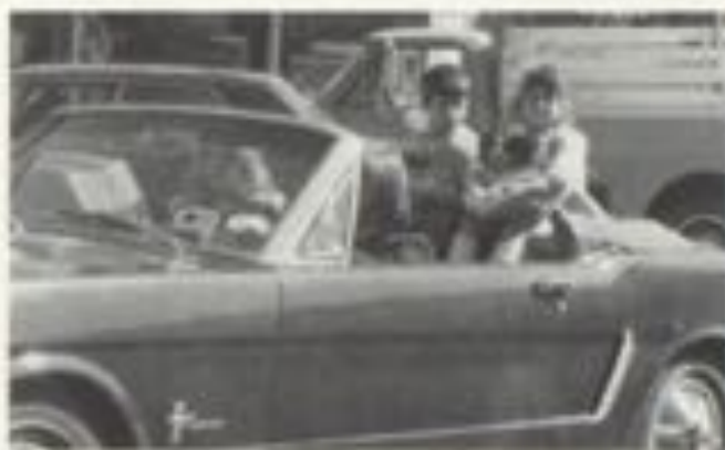
What's it all about?