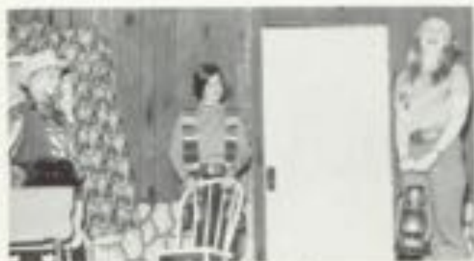
I love movie stars!