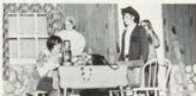
You'll pay for this.