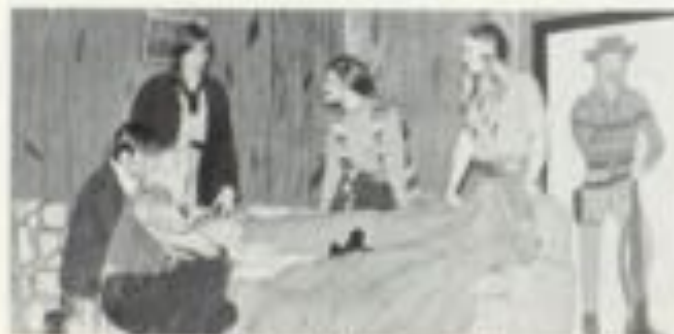
I ain't no basket case, yet