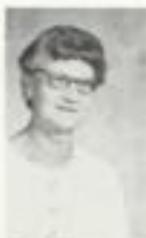
HOT LUNCH COOKS