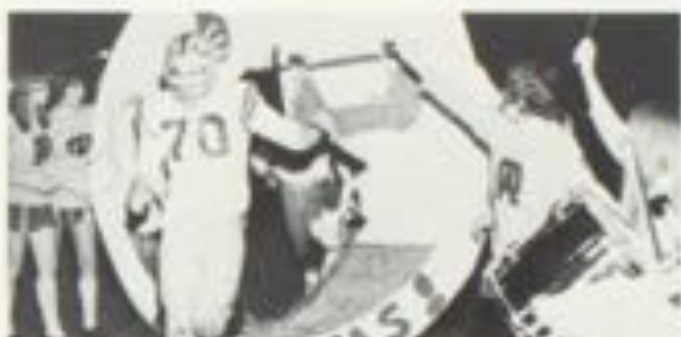
Go get 'em!