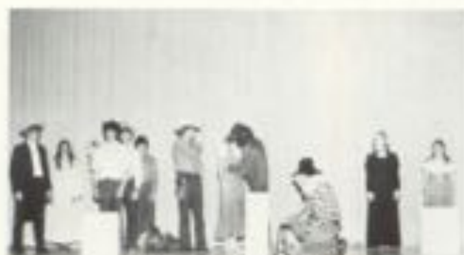
The Phantom of the old west