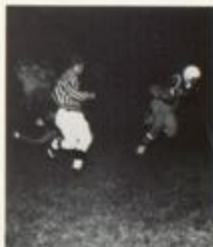
Where is everybody?