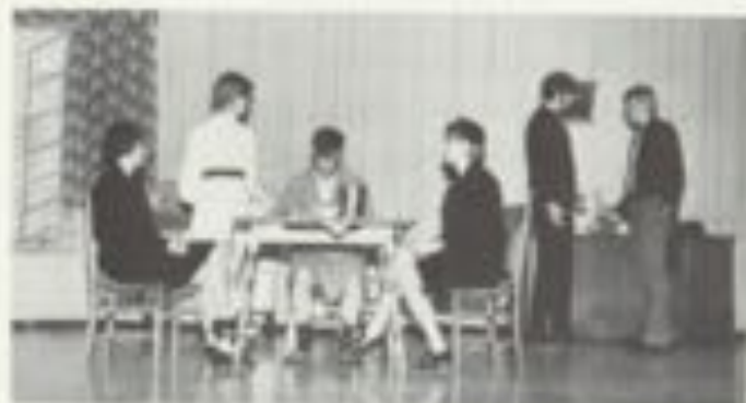
"The Dear Departed"