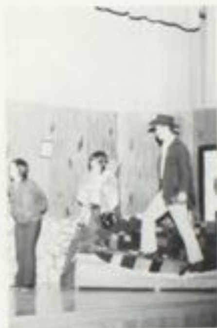
A real tin-man