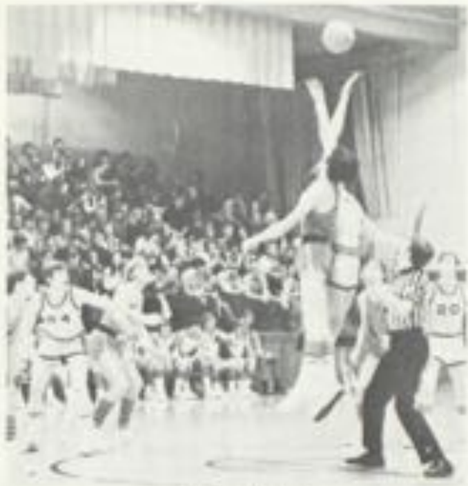
O-A meets LVA