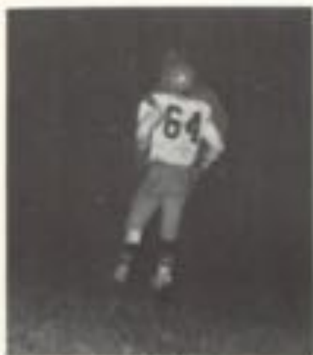
Go get 'em!