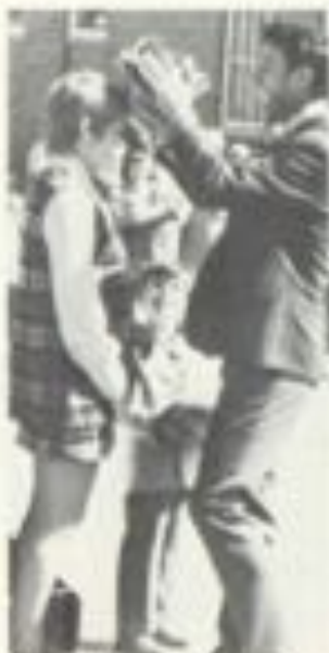
The Queen is crowned.