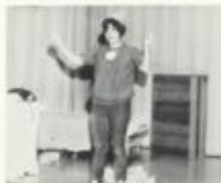
"... a woman like me!"