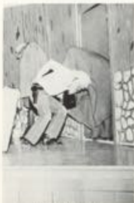
Where's he going?

Gold Dollar Margarita Annabelle Jethora Hester Delaney Handsome Tyrone Killmen Buckskin Frank Old Man Clanton Big Joe Jude Judge McQuain Phineas Clanton Billy Clanton Ike Clanton George Johnson Cowboy Steve Lonesome Lou