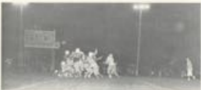
Scrape ' grapes?