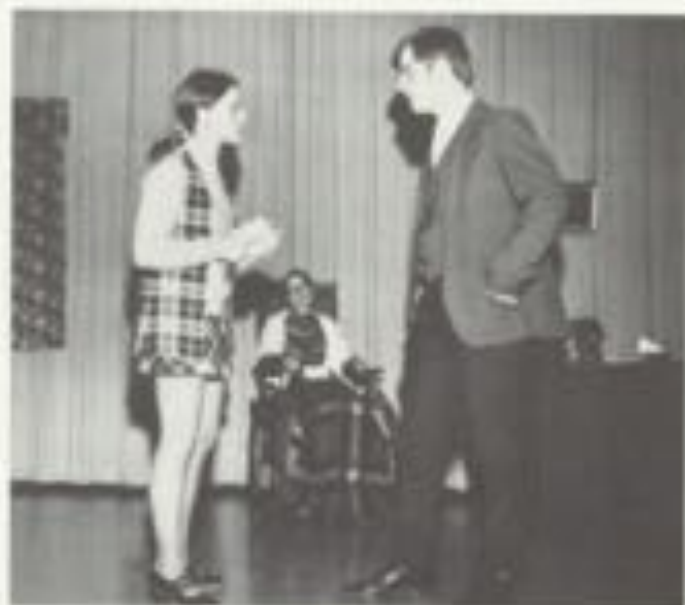
"The High Window"

Twenty-six students participated in the District Individual Speech Contest of which 13 earned a Division I rating making them eligible for the State Contest. At the State Contest, five students earned Division I ratings.