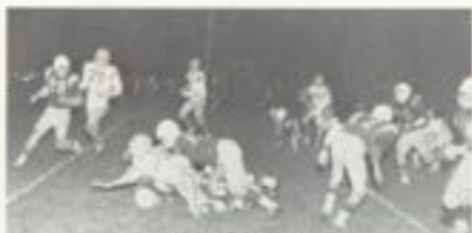
Hit the dirt!