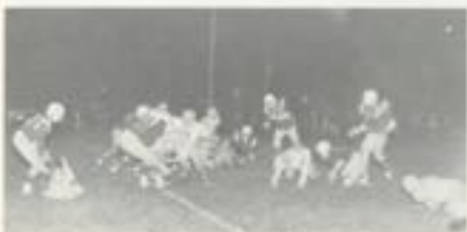
Where's the ball?