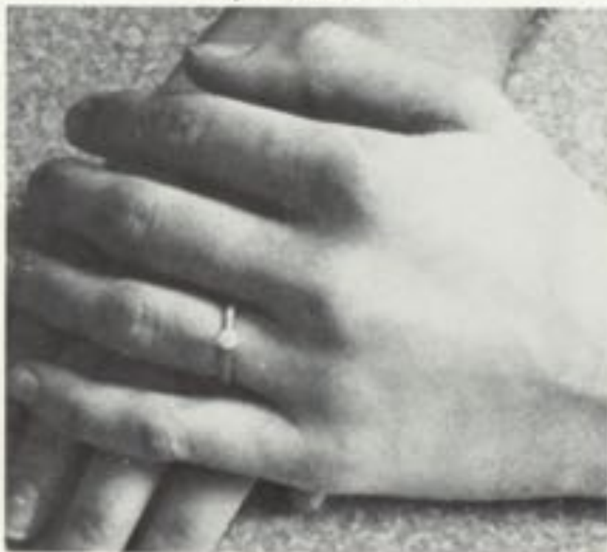
Becky S. 's indicated future.