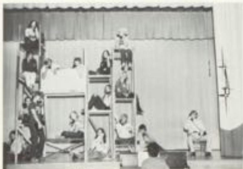
"Did they really get pinned?"