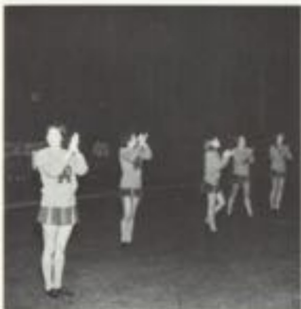
Go, fight, win!