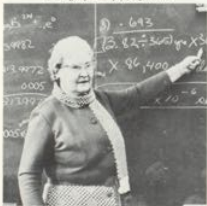
Miss Berg explains a physics problem.